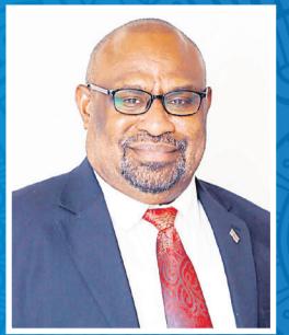
HON. JIMMY UGURO, MP MINISTER