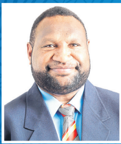
HON. JAMES MARAPE, MP PRIME MINISTER