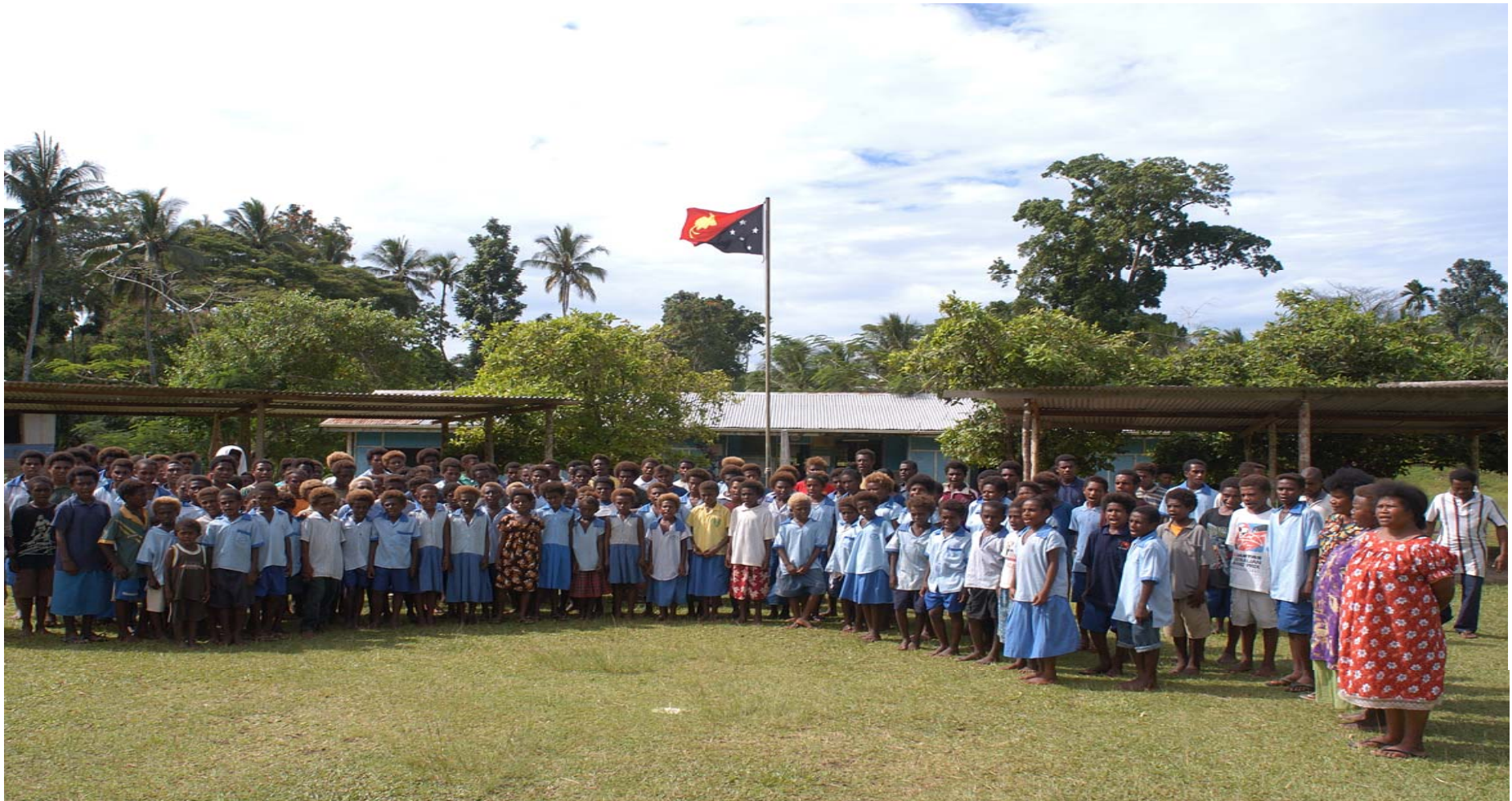
Maiom Primary & Elementary students in New Ireland Province during the Education Media and Community Awareness Campaign.