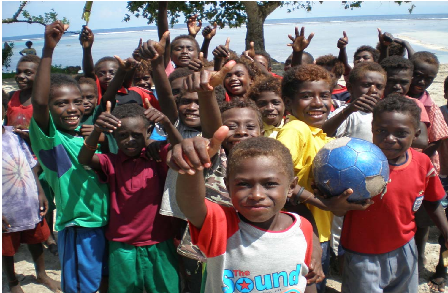
Students of Lontis Elementary School in the Autonomous Region of Bougainville..